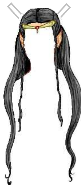
The Hair of Thingol