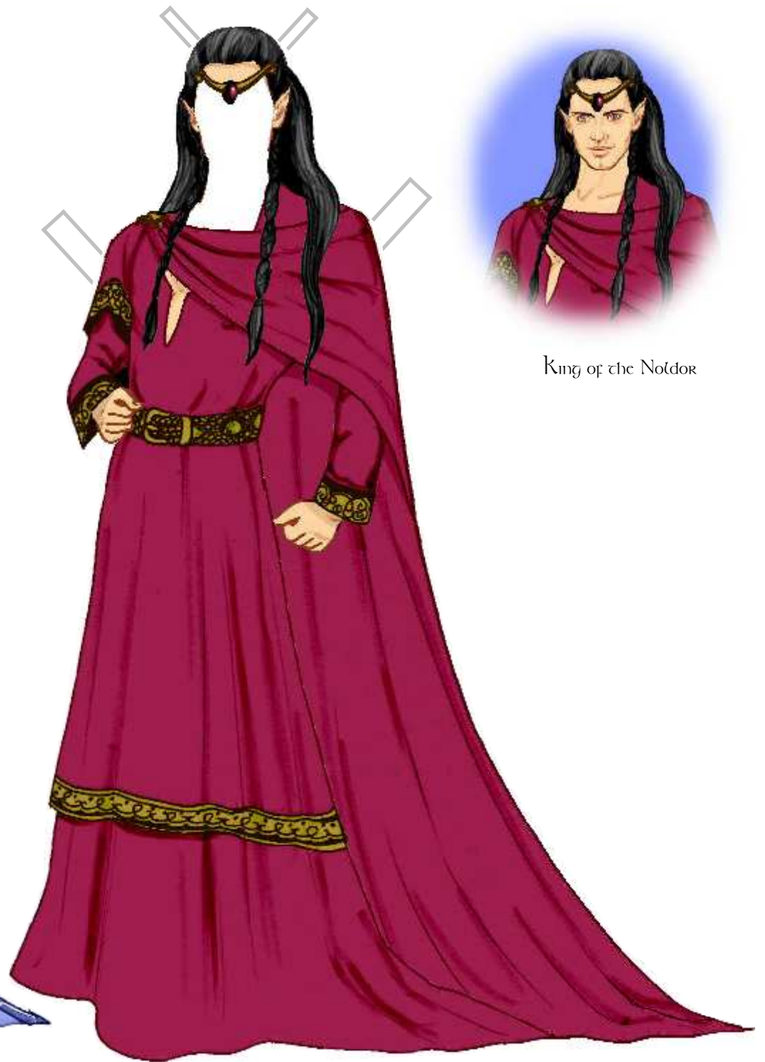
King of the Noldor