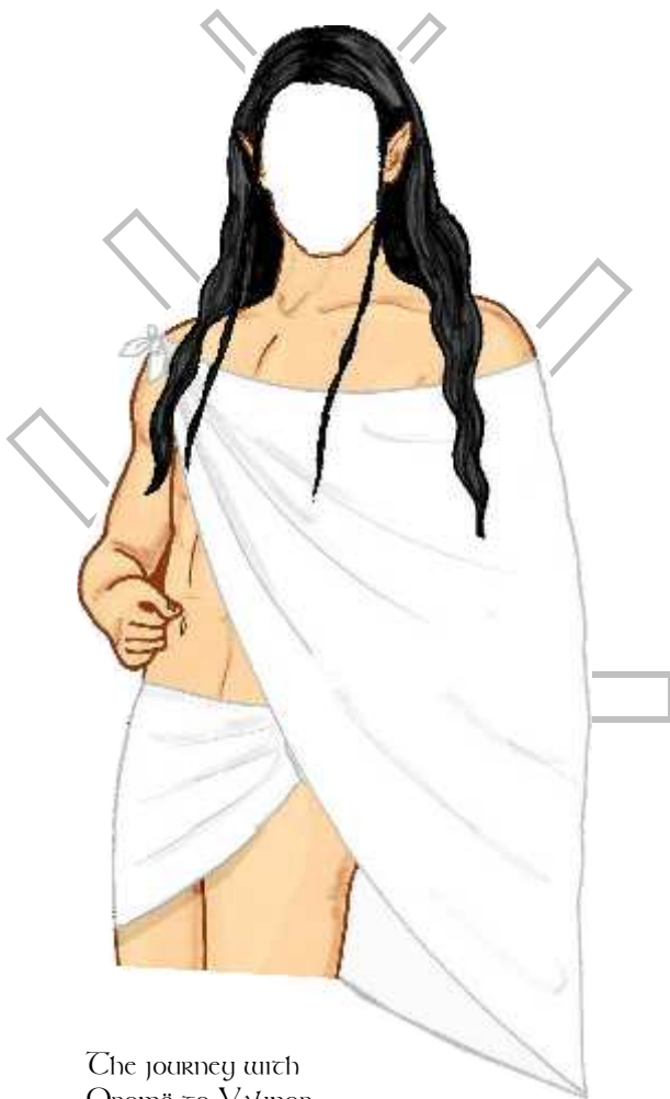
The journey with Oromë to Valinor

When Fëanor was exiled from Tirion, Finwë went with him to Formenos. There he was the first to be killed in Valinor when Melkor slew him at the doors of Formenos seeking the Silmarils. This act was the catalyst that led to the flight of the Noldor.